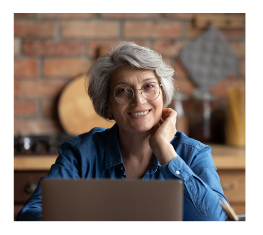
Learn more about these classes and others being offered at www.samcera.org/classes.

To register for a class, please email: communications@samcera.org